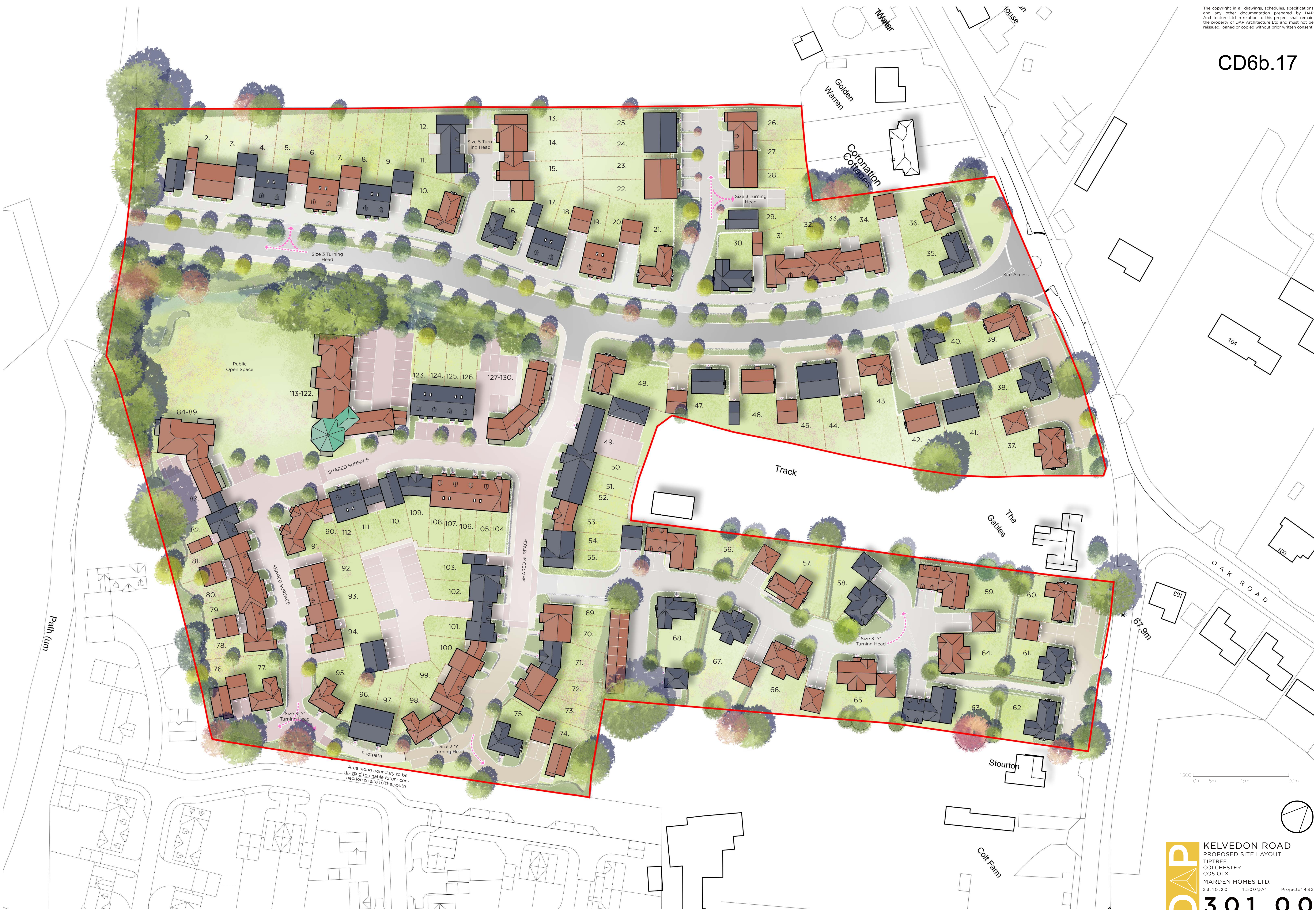
AS PROPOSED LAYOUT PLAN